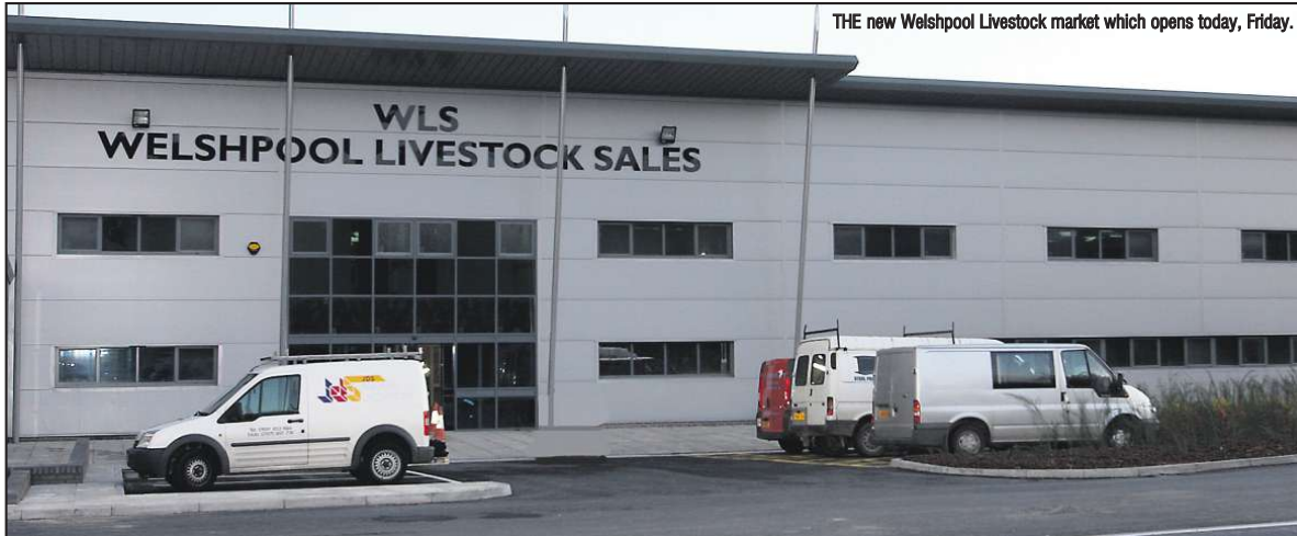
THE new Welshpool Livestock market which opens today, Friday.